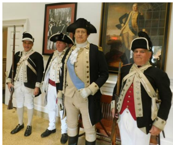
George Washington was accompanied by Continental soldiers and the Washington Crossing Fife and Drum Corps.