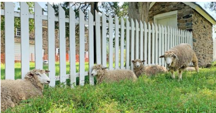
Nap time for Hannah, Hugh, Knox and Nathanael

First launched in 2020 to help fund the Thompson-Neely farmstead when the coronavirus hit Bucks County, the “Sponsor a Sheep” program has so far raised over $20,000 each year. This helped to keep the farmstead thriving despite the mandated reduction in visitors and normal park activities. Sheep sponsorships continue to be well-received through social media and web postings. With personal visitations resuming, it is hoped community interest will grow even more.