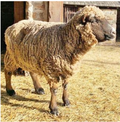
Our beloved Abigail, now passed away